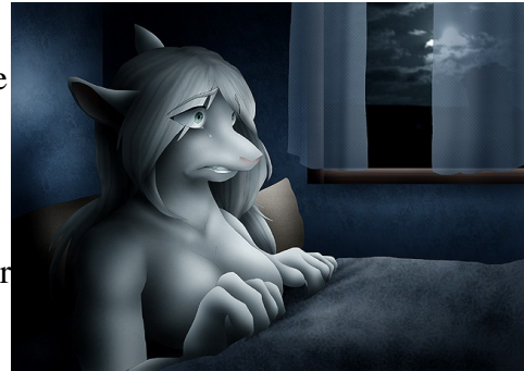
Illustration 3